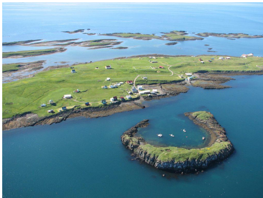
Figure 3 Flatey, [6].

Flatey is not connected to the national grid in Iceland and grid connections to the island are not viable due to technical, economic, geographical, and climatic limitations. Due to this fact, the island needs to be self-sufficient when it comes to power production. All power production on the island today is done using two diesel aggregates. With increased awareness of the polluting effects of burning fossil fuels along with rising oil price and rapid price reduction of renewable energy, all further development on Flatey's power system is set towards a greener system. In Iceland 98% of electricity production comes from renewable energy sources, where hydro power and geothermal power are the building pillars. That leaves around 2% of the electricity generation to the burn of fossil fuels [7]. The goal is to further reduce this ratio as well as the Icelandic government has set a goal to increase the diversity of energy production