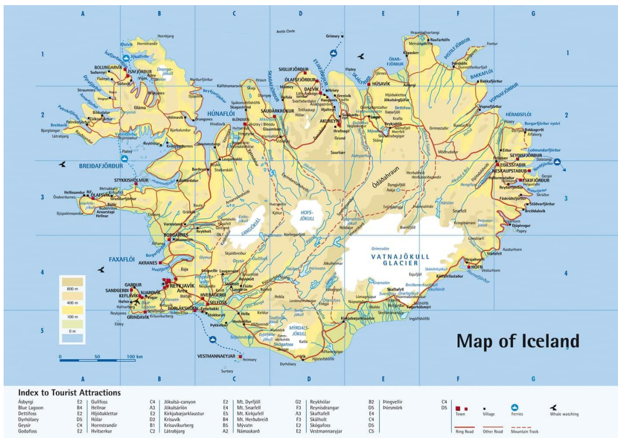
Figure 1 Map of Iceland. Note the location of Flatey in Breiðarfjörður to the North West.

Flatey is a small island located in the centre of Breiðarfjörður in the north-western part of Iceland, Figures 1 and 2. The island is around two kilometres long and one kilometre wide and the landscape is, as the name indicates, almost completely flat, Figure 3. Until the latter part of last century the population on the island was growing and the island was in relation to its size heavily populated. Due to social change, change in the labour market and settlement condensation, the population has dwindled down and as of today there are only around 6 to 10 persons with permanent year-round residence on the island. The habitation on the island is seasonal, in the summertime considerably more persons live or spend time on the island. Some permanently move to vacations homes, some spend a few days at the island's hotel and others spend the day exploring the island. The main industry on the island today is tourism and the main attraction on the island is the cultural history and old village that mostly is in its original shape along with the unspoiled nature and wild bird life.