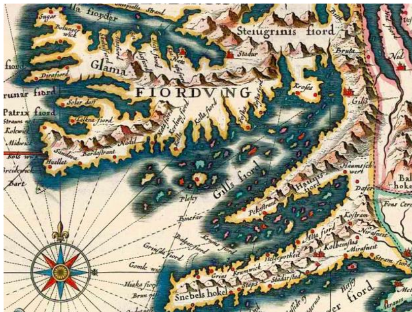
Figure 2 From an old map, Flatey (Platey) is clearly marked, [5].